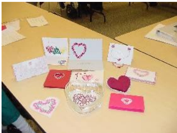
Here are the Valentine exchanges.