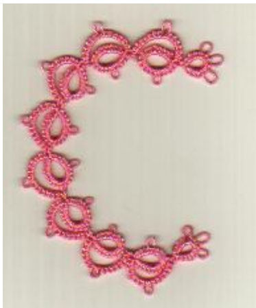
(Alphabet designed by Heidi Sunday)

In size 20 thread, it measures 2” wide by 3” tall.