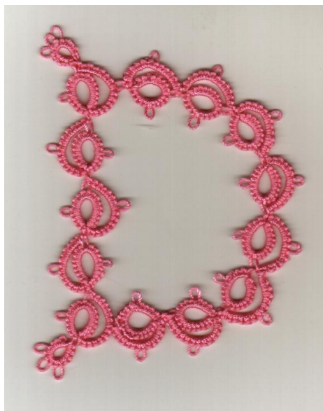
(Alphabet designed by Heidi Sunday)

In size 20 thread, it measures 2” wide by 3” tall.